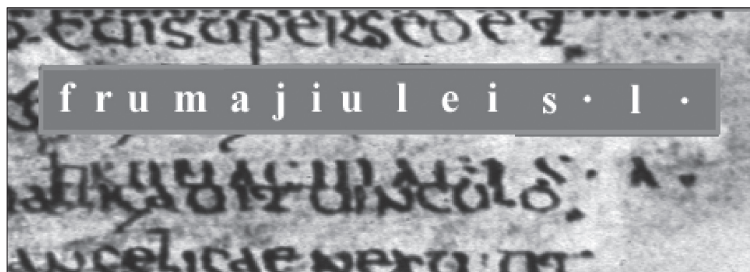
Figure 4. frumajiuleis l (frame and transliteration added)

European, the scope of potential etymons increases. Following Tille's suggestion, I propose the Biblical jubilee as the source of this family of words. The key for my proposal is the early Christian custom of using nomina sacra . Considering the list of such sacred names: Christ, Lord, Savior, David, Israel, Man, or Jerusalem, a term such as the 'Redeemer' fits in well.