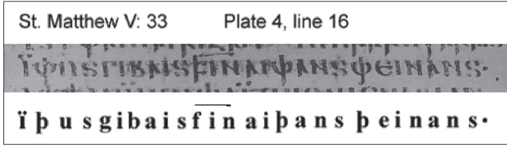
Figure 3. An abbreviation in the Codex Argenteus

While the sacred names in the Codex Argenteus are marked with horizontal strokes over them, the abbreviations in the Ambrosian manuscripts are not.